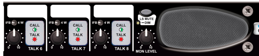
Close-Up Of The CM-TB8 Front Right Hand Side.