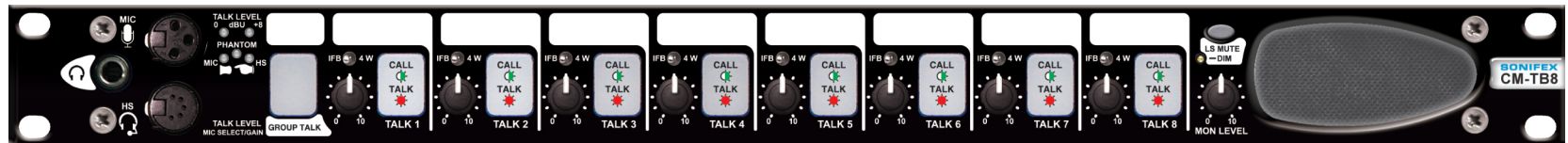
CM-TB8 Front View.

The unit has a built in line-up tone generator for easy channel identification and cabling