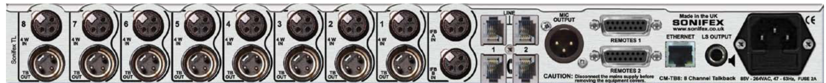
CM-TB8 Rear View Showing Optional CM-TB8T Card.