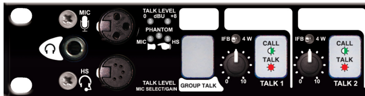
Close-Up Of The CM-TB8 Front Left Hand Side.